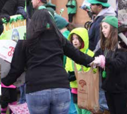
Candy for all.