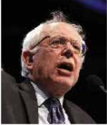
US Senator Bernie Sanders, Independent from Vermont

“What world are the five conservative Supreme Court justices living in? To equate the ability of billionaires to buy elections with ‘freedom of speech’ is totally absurd. The Supreme Court is paving the way toward an oligarchic form of society in which a handful of billionaires like the Koch brothers and Sheldon Adelson will control our political process.”