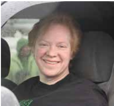
Our UMWA driver